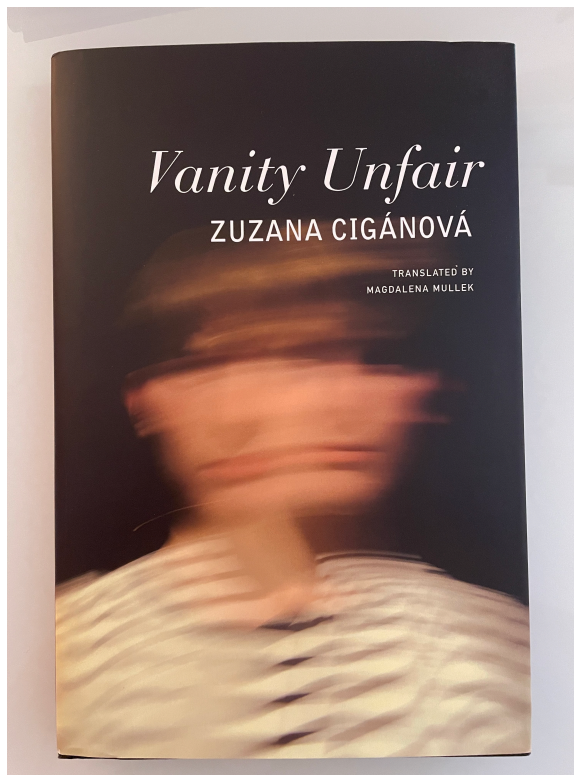
The cover of Vanity Unfair

ZC: Keep your eyes open, and when something catches your attention that you think is worth remembering, write it down. Take notes, and later they may turn into something. ♦